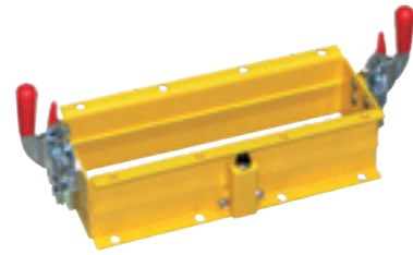
Detachable piece chute