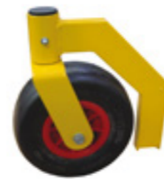
Front swivel wheel