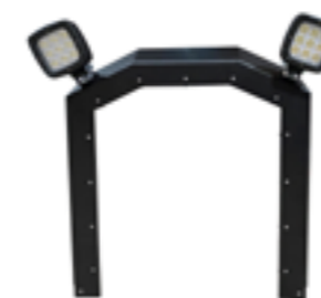
Work light set