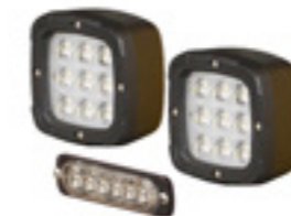
Work light set