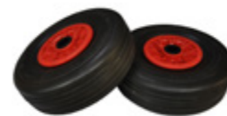
Leakproof swivel tires