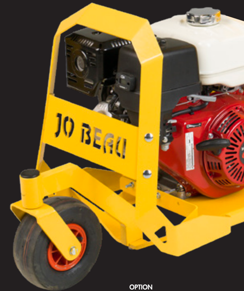
OPTION FRONT WHEEL

The CO 2 -emission-free E300 with its 11Kw powerful electric motor is the best option for indoor use . When the motor is activated, a minimum of decibels is released, making working with this powerhouse even more pleasant.