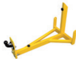
Lifting kit trailer