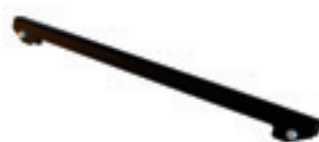
Wheel fixation bar