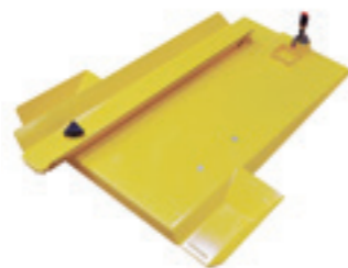
Conversion kit tracked base