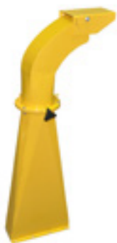
High rotating chute